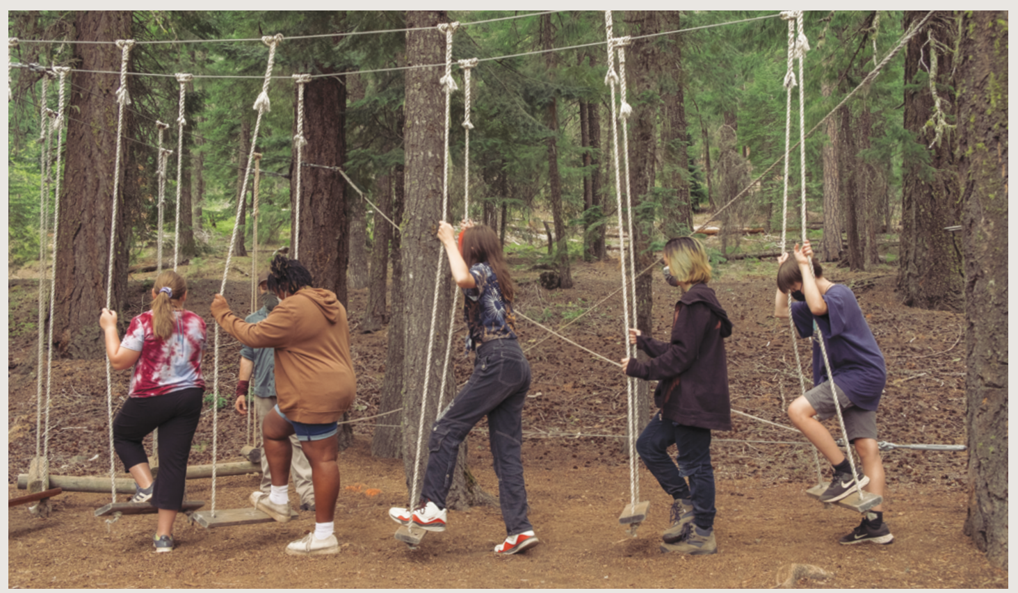
WHO WE SERVE

We work with schools to engage and mentor underserved youth experiencing systemic opportunity gaps. We typically partner with school counselors to identify youth who would benefit from increased creative learning opportunities in a mentor-led, supportive peer community.