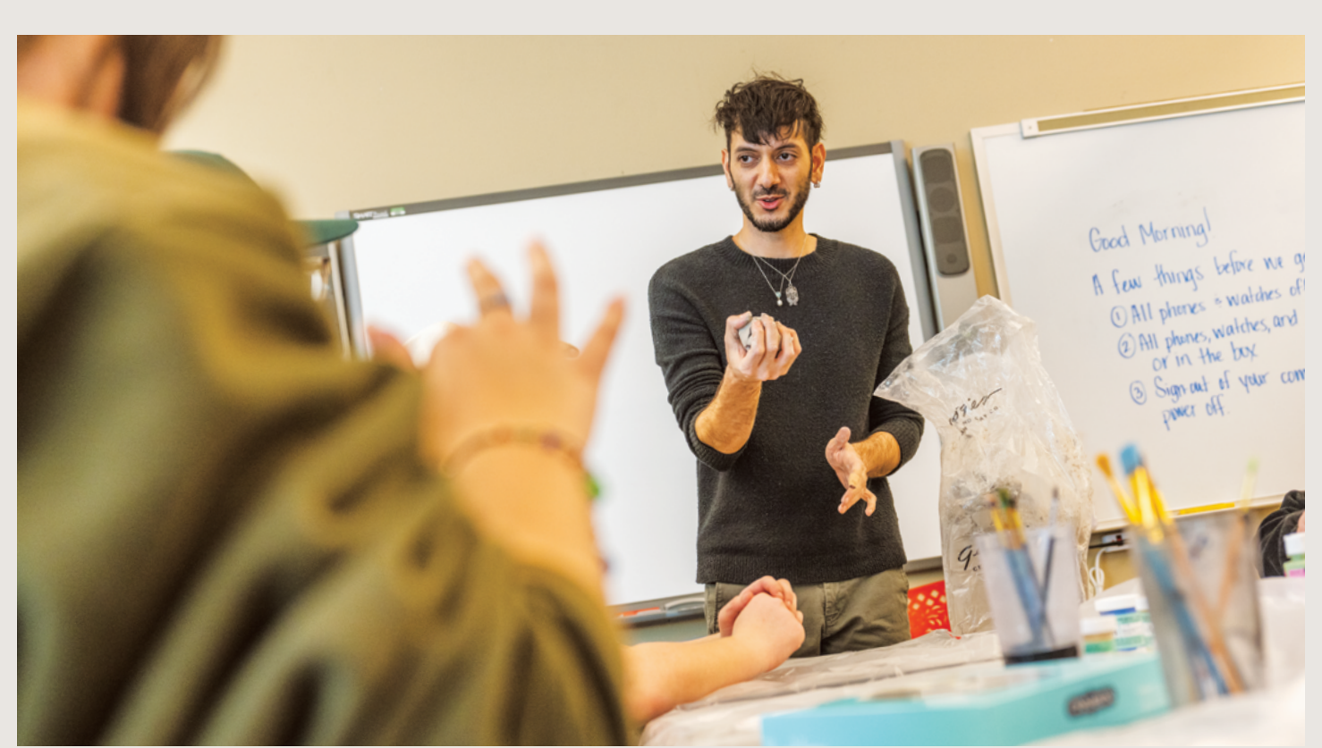
Caldera in-school programs